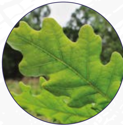
close up of its leaves