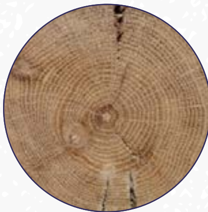
rings of wood