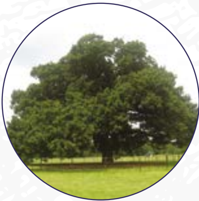
The whole tree