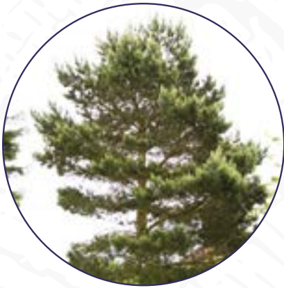
The whole tree