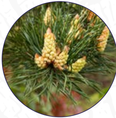
close up of its needles