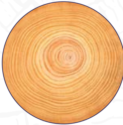
rings of wood